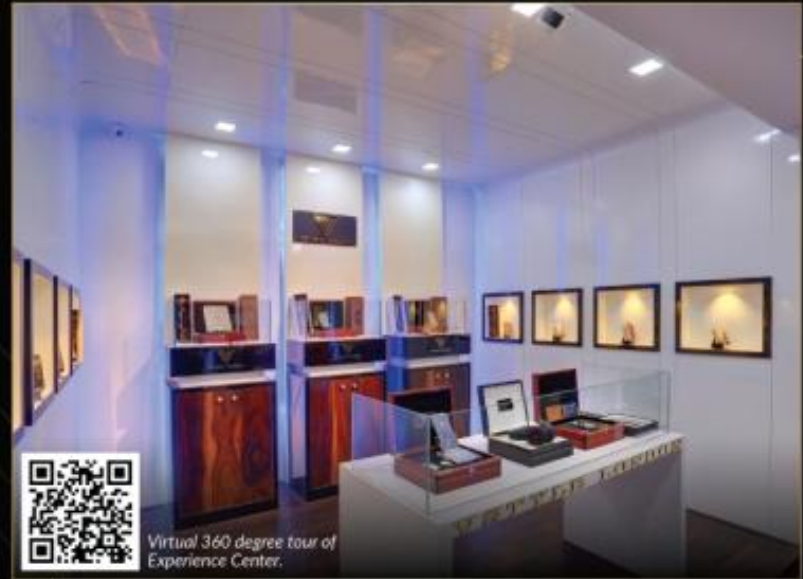
Virtual 360 degree tour of Experience Center.